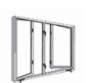
TWIN SWING-OUT CASEMENTS