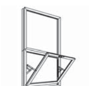
FIXED LITE OVER PROJECT-IN HOPPER