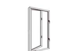
SINGLE SWING-OUT CASEMENT