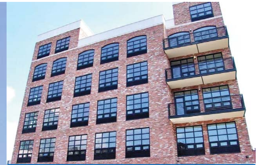
CUSTOM SHAPED WINDOW Location: Williamsburg, Brooklyn, NY