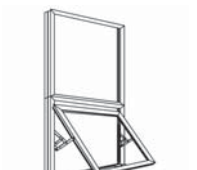
FIXED LITE OVER PROJECT-OUT AWNING