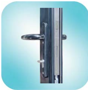
HANDLES WITH LOCKSET